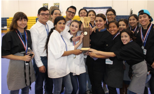
Calipatria culinary team and quiz bowl champions