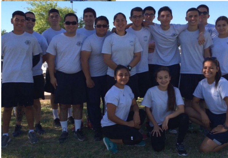
The ROP/CTE Central Union High School Law Enforcement Skills Competition Champions.

Central Union High School student participating in the "Dummy Drag" event at the IVROP Law Enforcement Skills Competition